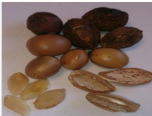
Figure 1 - Different parts of the Argan fruit

The fruits of the Argan tree and their leaves are harvested in the village of Tidzi province of Essaouira, The collected samples are dried in the open air then pulped, crushed and finally reduced, separately, in fine powder (Bellementaine et al., 2011).