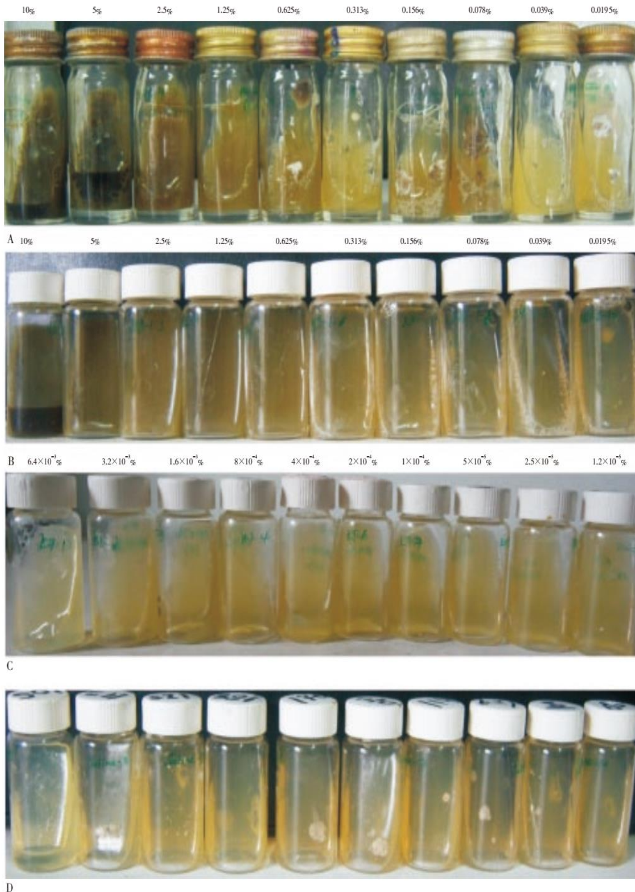
Figure 2 - The MICs of aqueous and n-butanol extracts of P. dodecandra against H. capsulatum var. farciminosum . A: MIC of aqueous extract: growth was observed starting at 0.625%; B: MIC of n-butanol extract: growth was observed starting from 0.039%; C: MIC of ketoconazole (standard): growth was observed at a concentration of 1.2 \times 10^{-5}\% ; D: Saline diluted Sabourauds dextrose agar (negative control): growth was observed in all agar plates (Mekonen et al., 2012).