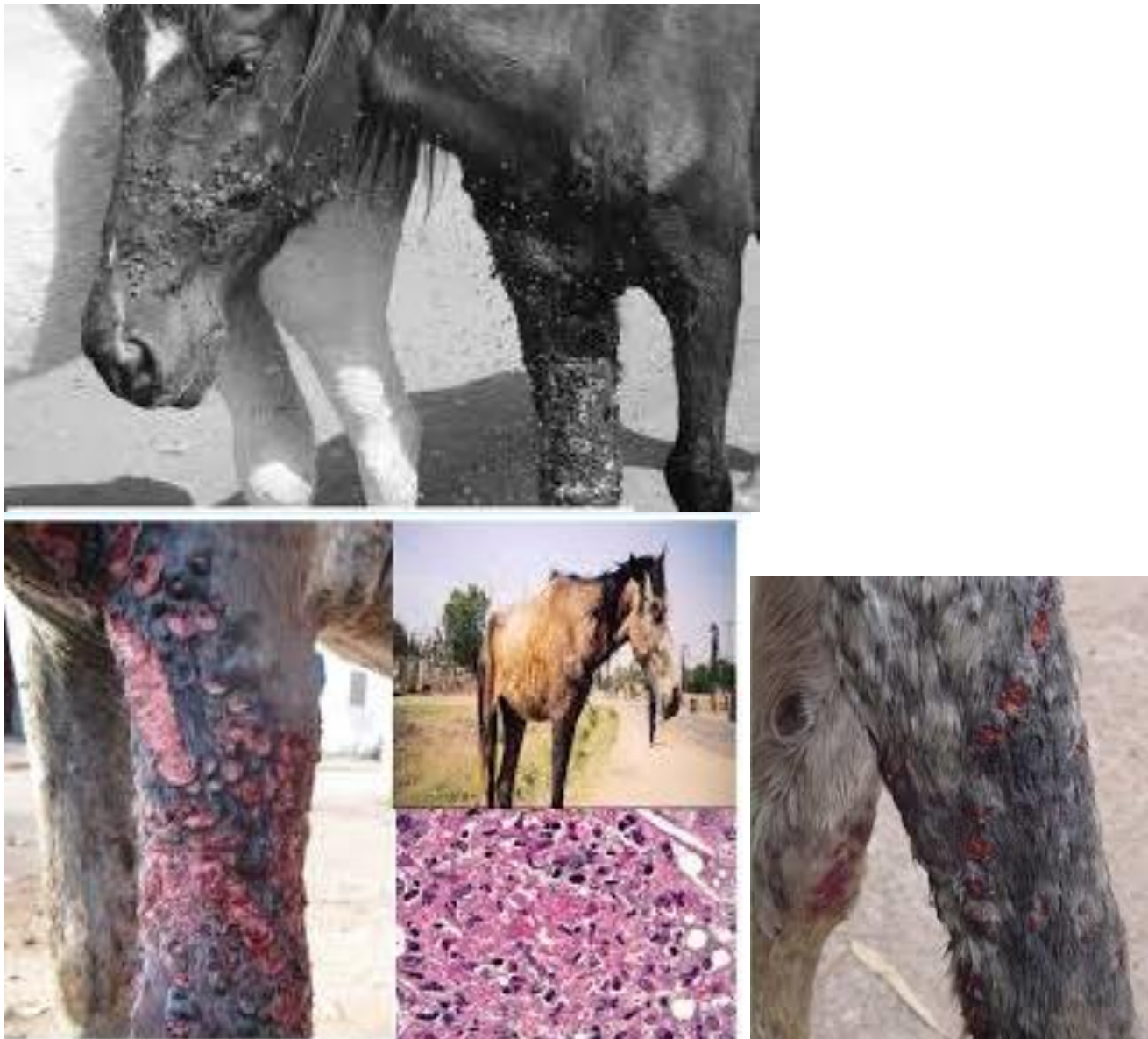
Figure 1 - Lesions of Epizootic lymphangitis (Wondmnew and Teshome, 2016).