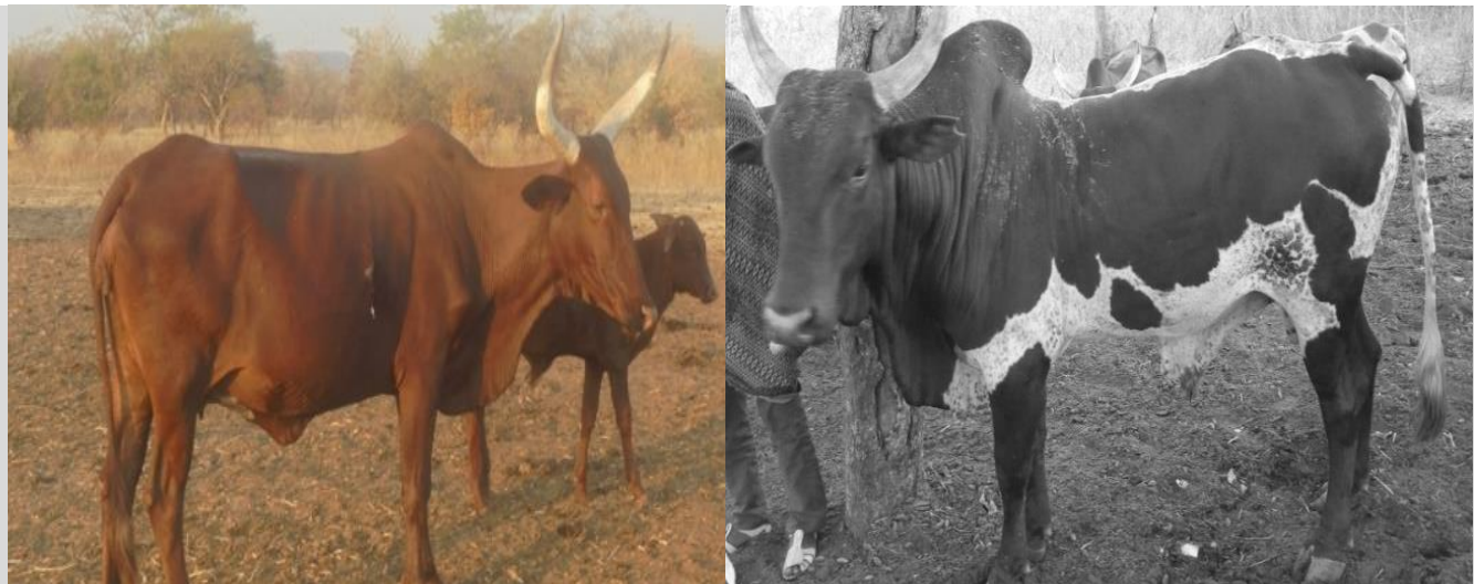
Figure 4 - Breeding female to the left and breeding male to the right in Fellata cattle.