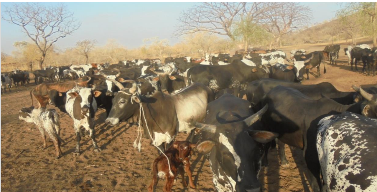
Figure 7 - Rutana or Miramir cattle type.