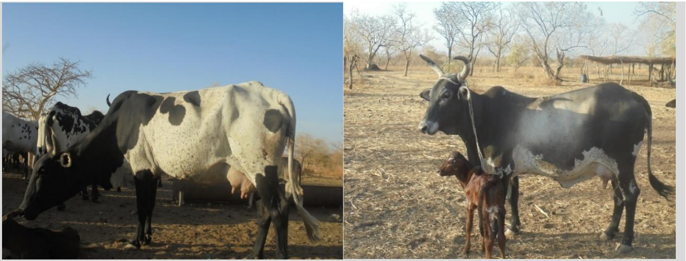
Figure 8 - Breeding female to the left from Rutana and right from Miramir.