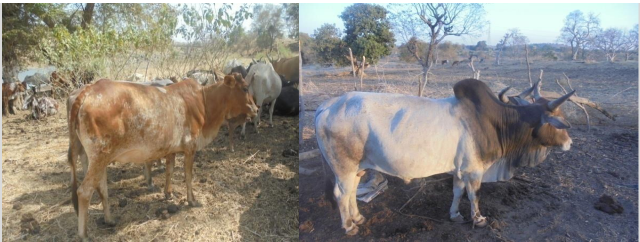
Figure 6 - Breeding female to the left and breeding male to the right in Qocherie cattle.