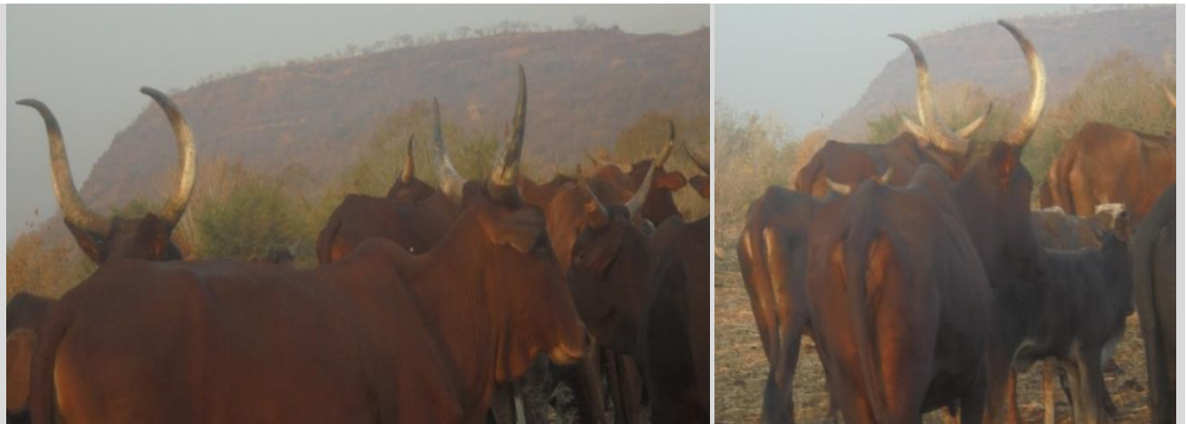
Figure 3 - Fellata cattle type.