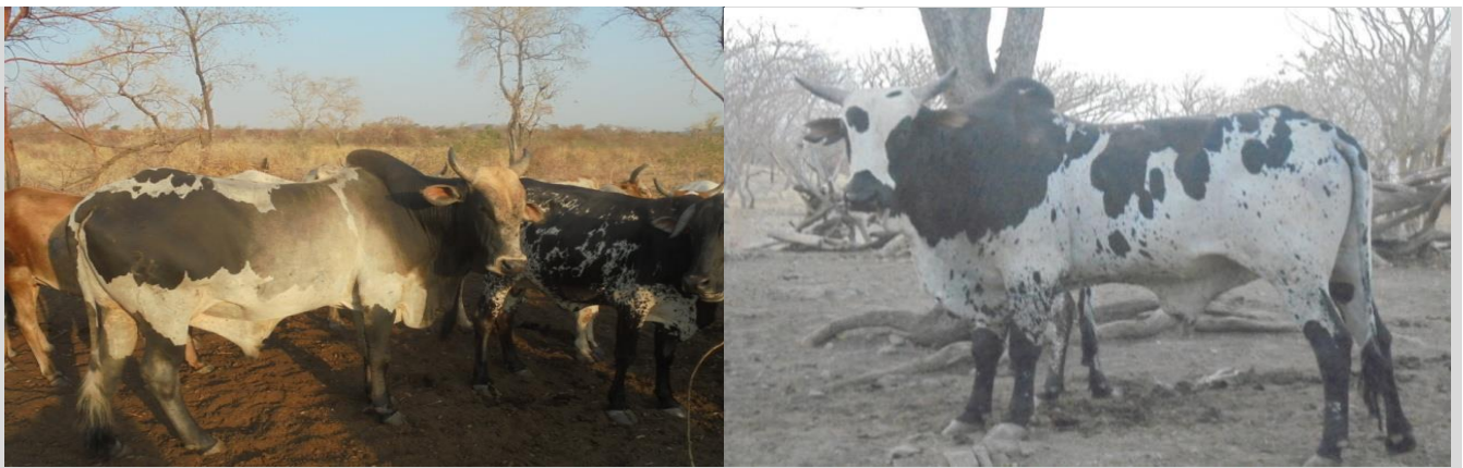
Figure 9 - Breeding male to the left from Rutana and right from Miramir.