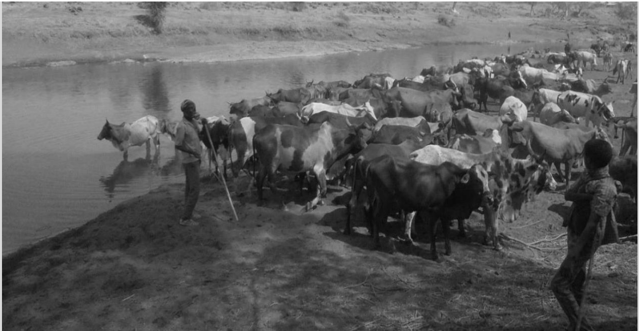
Figure 5 - Qocherie cattle type.