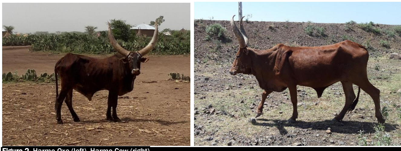
Figure 2- Harmo Oxe (left). Harmo Cow (right)

Oxen were dominant over cows on most of the measurements, which follow the Rensch's rule (Rensch, 1950) where the males of a particular species are usually larger than the females. The differences between the oxen and cows may be further ascribed to the testosterone hormones secreted within the oxen which leads to enhancement of muscle mass and skeletal development (Baneh and Hafezian, 2009). The sexual dimorphism of the animals may be ascribed to the differences in the endocrine system of the two sexes; estrogen hormone has a limited effect for growth in females (Chriha & Ghadri, 2001; Baneh and Hafezian, 2009). The results were in line with the results of Genzebu et al. (2012) on Arado cattle and Endashaw et al. (2015) on Mursi cattle who reported that oxen were larger than cows. Similarly, dominance of bucks over does were reported in Ethiopia (Mustefa et al., 2019).