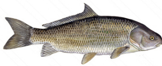
Black Buffalo Fish-ictiobus, Niger