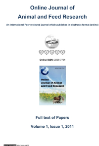
Table of Contents, 25 Jan 2011