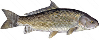
Black Buffalo Fish-ictiobus, Niger