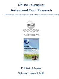
Table of Contents, 25 March 2011

Research Title and Field Article (Abstract) 1 2 3 4 5 6 7 8 9 10 11 12 13 14 15 16 17 18 19 20 21 22 23 24 25 26 27 28 29 30 31 32 33 34 35 36 37 38 39 40 41 42 43 44 45 46 47 48 49 50 51 52 53 54 55 56 57 58 59 60 61 62 63 64 65 66 67 68 69 70 71 72 73 74 75 76 77 78 79 80 81 82 83 84 85 86 87 88 89 90 91 92 93 94 95 96 97 98 99 100