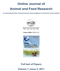
Table of Content, 25 Sep 2011