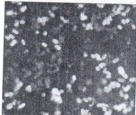
Figure 3 - Intestinal impression smear from a pig infected with enterotoxigenic Escherichia coli stained by indirect immunofluorescence with anti-fimbria antibodies and fluorescein-isothiocyanate-conjugated anti-immunoglobulin. Many fluorescing bacteria are present (x1200).

Besides age related resistance of piglets to K88 + and F18 + ETEC strains, there may be lineage-related resistance to infection. In each of the cases, susceptibility is an autosomal dominant trait and the inability of the pigs to express the required receptors on enterocytes is due to resistance. An experiment mounted to demonstrate expression of K88 receptors from four different breeds of pigs showed that there was substantial variation in the prevalence of susceptible pigs among the breeds (Bakar et al., 1997). The prevalence of pigs of the F18 susceptibility phenotype has not been determined, though casual observation suggests that it is considerably higher than that 88 ETEC susceptibility K88 and F18 receptors present on swine erythrocytes. K88ab and K 88ac in swine erythrocyte possess a receptor which has been identified as a mucin-type sialoglycoprotein (MTSG). This molecule often gets attached to the border of the brush surface of erythrocytes (Erickon et al., 1992). Those pigs that show (MTSG) are susceptible to K88ab + and K88ac + ETEC and the piglet acceptance to K88 ETEC correlates with the